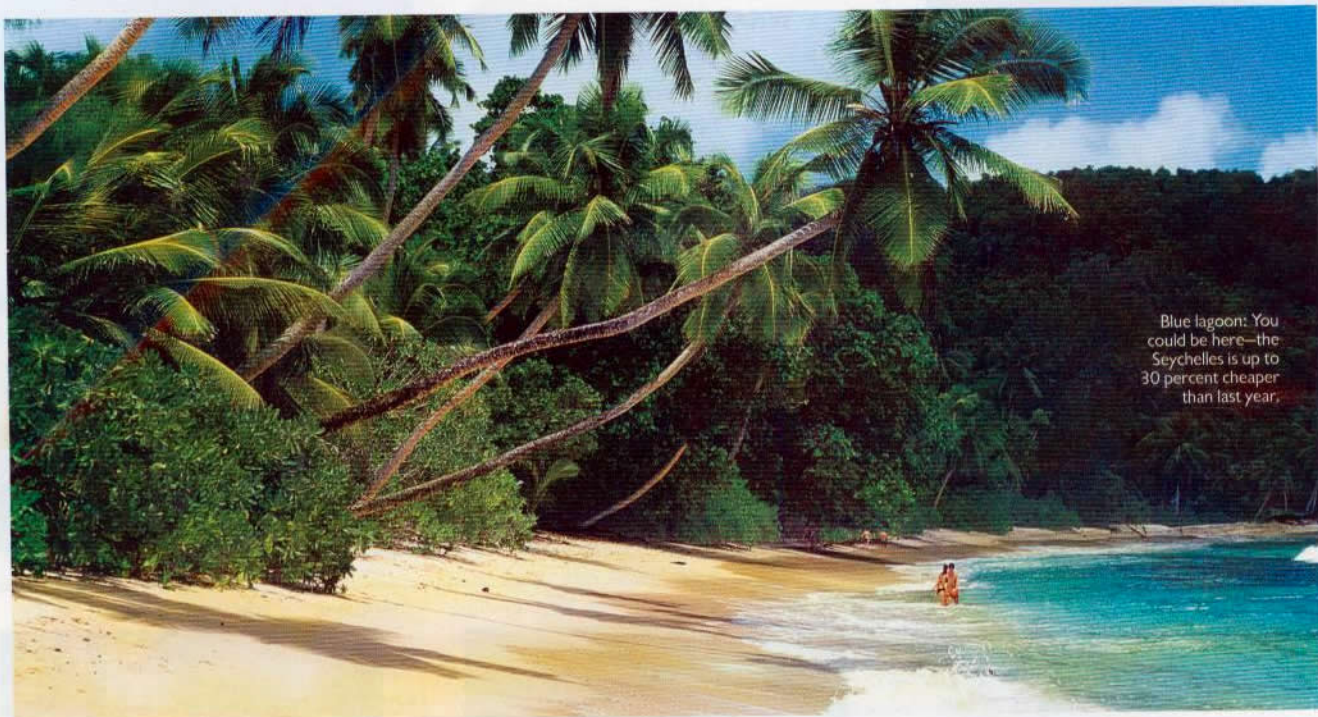
Blue lagoon: You could be here—the Seychelles is up to 30 percent cheaper than last year.