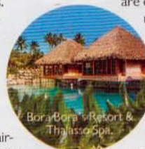
Bora Bora Resort & Thalasso Spa.

First, check Air Tahiti Nui for up-to-the-minute deals. Second, get ready for significant savings—some hotels are discounting by as much as 42 percent. InterContinental's Moorea property will charge you for only three nights when you stay for five (doubles, $221); its Resort & Thalasso Spa on Bora Bora offers the same deal (doubles, $771); and the Tahiti property has a three-night special for $570 total, down 33 percent from last year. Book through: Kleon Howe of The Art of Travel (888-294-3598; kleon@theartoftravelonline.com).