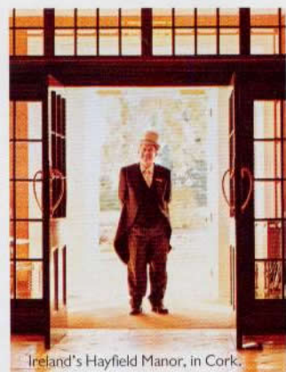
Ireland's Hayfield Manor, in Cork.

Imagine a week of coasting past glaciers and the Pacific Northwest's loveliest islands on a cruise line luxe enough to make Condé Nast Traveler's Gold List 15 years in a row. Sound expensive? It's not: The July price tag, $449, means you pay less than $70 per all-inclusive day. Celebrity Cruises, itching to fill empty ships, has never dropped rates this low (competitors like Holland America are offering similarly slashed prices). And it's easy to get to Seward port, which is close to Anchor-